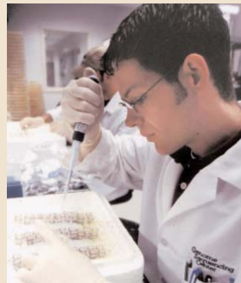
As part of the International Human Genome Consortium, Washington University researchers helped map the sequence of our genetic building blocks.

For more detailed information, visit impact.wustl.edu