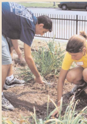
Students volunteer many hours, including maintaining community gardens.

Washington University's students, faculty, and staff regularly volunteer for community service in many areas. They serve as tutors, hold food and clothing drives, sponsor activities for at-risk children, assist the homeless, host Special Olympics events, and serve on institutional boards.