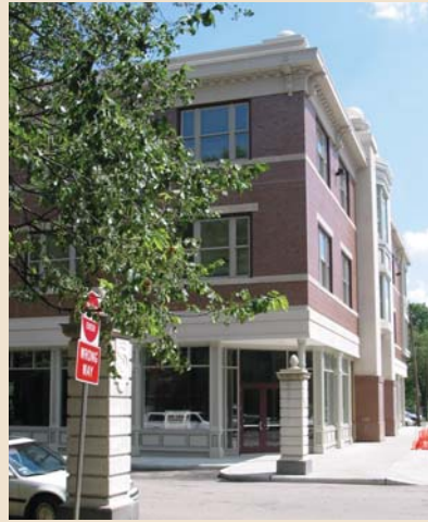
Community-friendly retail space is part of the new office building at 276 N. Skinker.