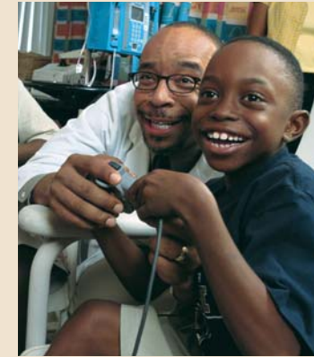
Washington University physicians form close bonds with patients and families.

World-class physicians and outstanding hospital facilities at the Washington University Medical Center provide St. Louis with medical care second to none. Our School of Medicine is rated as one of the top three in the nation, attracting exceptional medical students and residents who learn and work in hospitals and clinics managed by BJC HealthCare. The School of Medicine provides more than $30 million in unreimbursed medical care for those patients who cannot afford care. The medical school offers wellness and preventive care programs for about 100,000 St. Louisans each year.